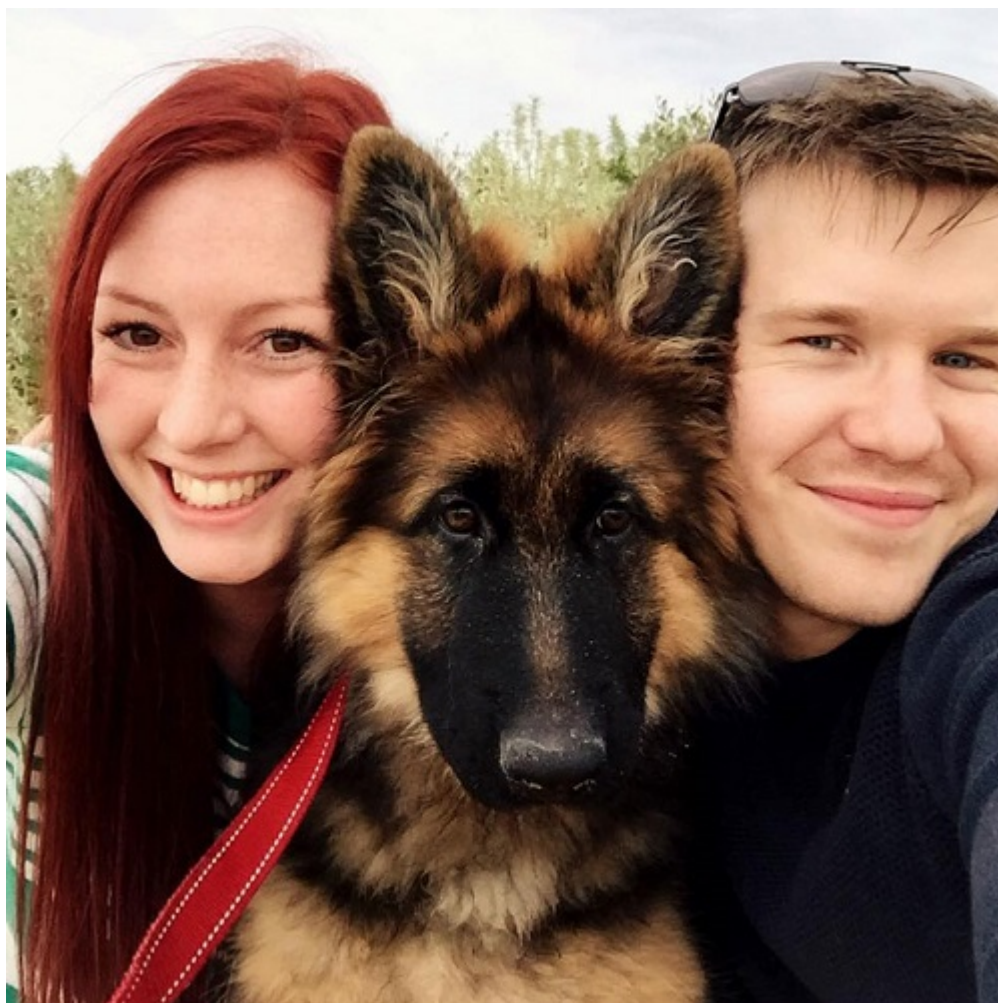
Nasra With Her Owner